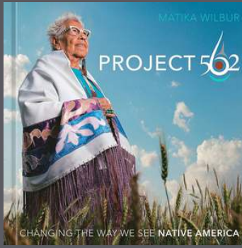
Project 562: Changing the Way We See Native Americans by Matika Wilbur