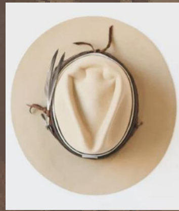
Thunder Voice Hat Co www.thundervoicehatco.com