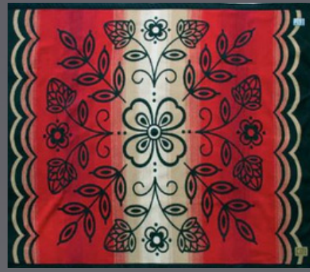
8th Generation www.eighthgeneration.com Renewal Wool Blanket by Sarah Agaton Howes