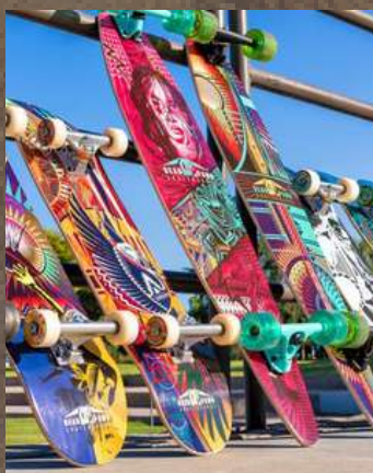
Dead Pawn Skateboards www.deadpawnskateboards.com