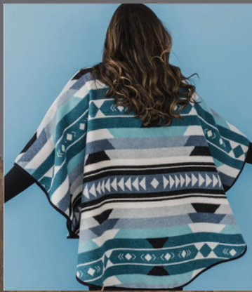
MINI TIPI www.minitipi.ca Tundra Reversible Shaw