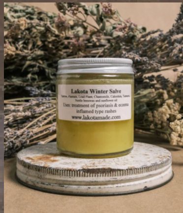
Lakota Made LLC www.lakotamade.com